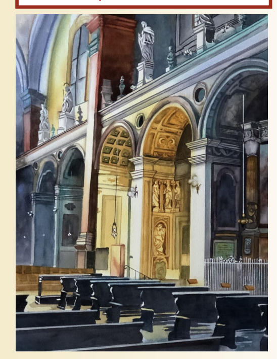
"San Giacomo Maggiore, Italy " by Sue Roach