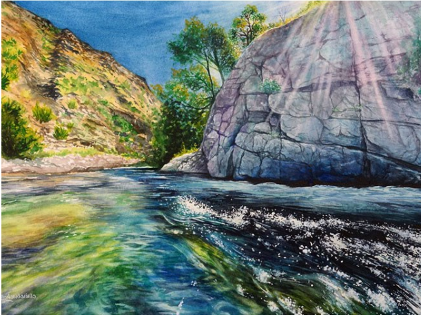
"The Color of Light" by Claire Bischoff