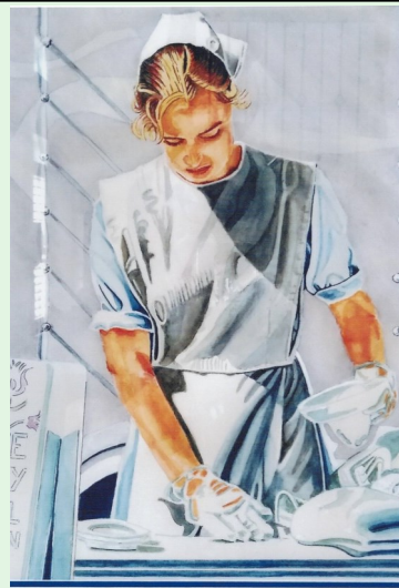
“Amish Girl #1 “