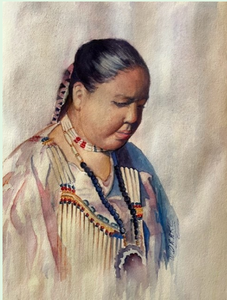
“Contemplation” by Wanda Drake