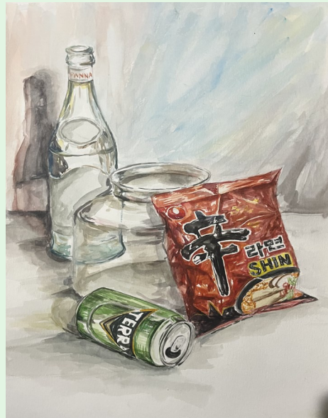
“Hot” by Clarice Chung