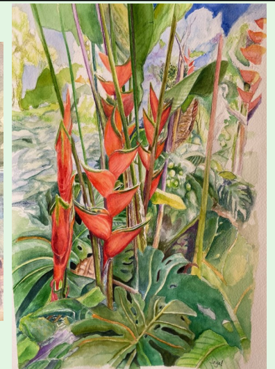
“My Tropical Favorite” by