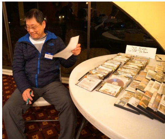
Tet with NVWS DVDs for rent