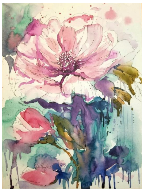
Transparent Award - Metamorphosis Lin Pacific