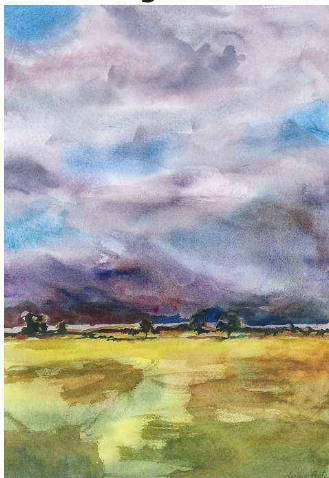
Best in Show – Mountain Meadow by Laurie Ponte