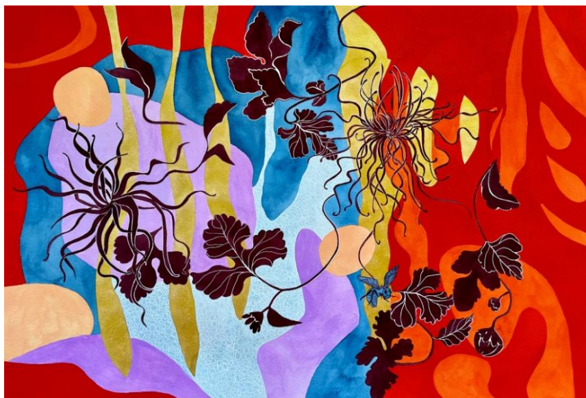
Second Place – Mon Monde Magnifique by Elena Pishaya Wherry