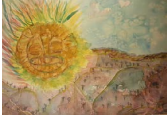
Inti Raymi, A Sun Festival