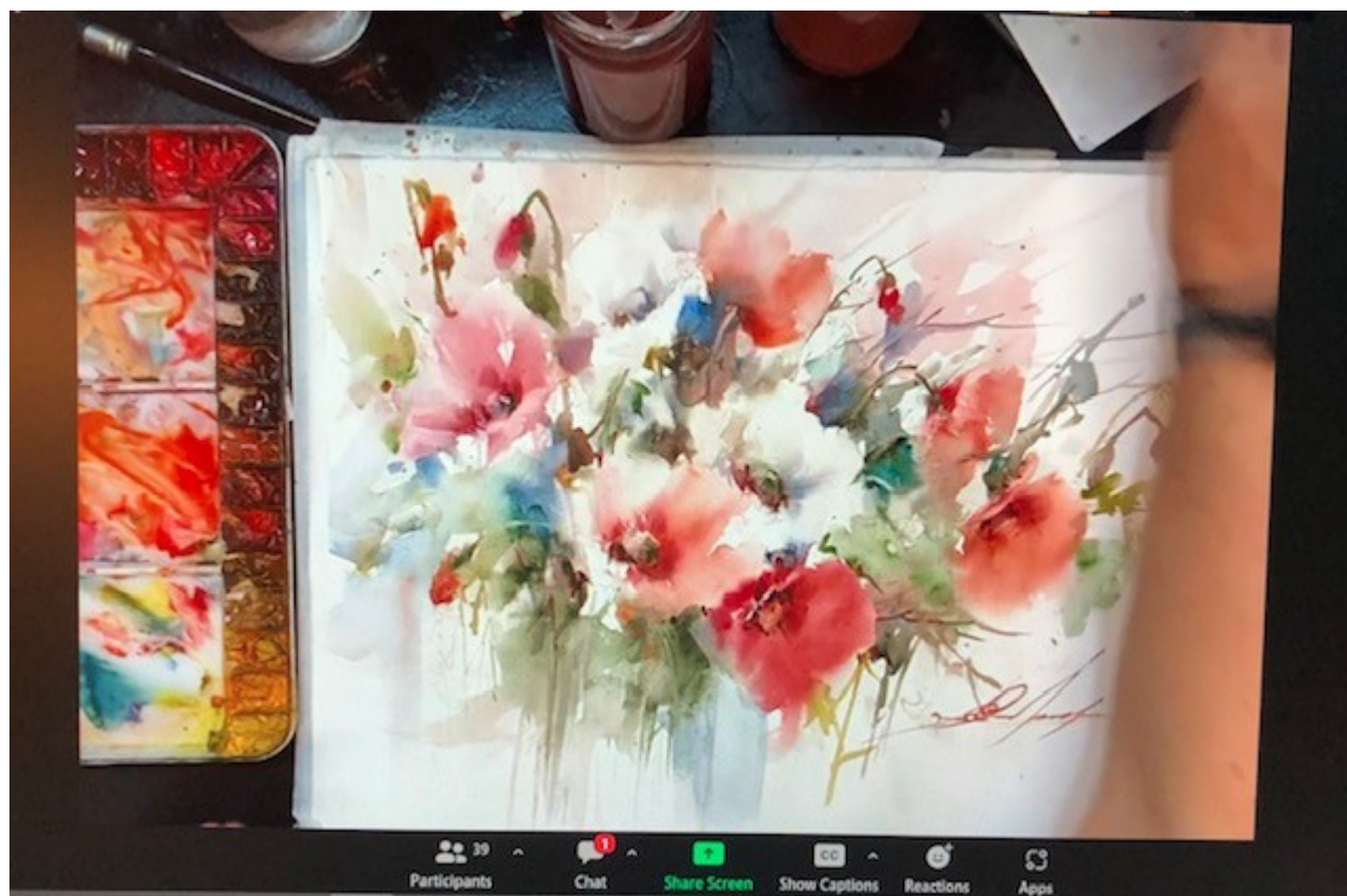
Fabio's finished paintings – Day 2