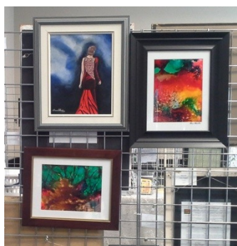
Anne's oils in 2015