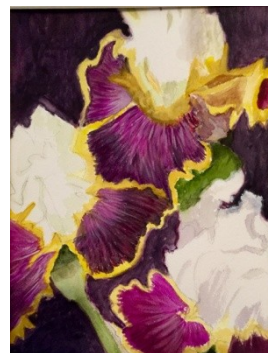
One of Anne's watercolors in 2016