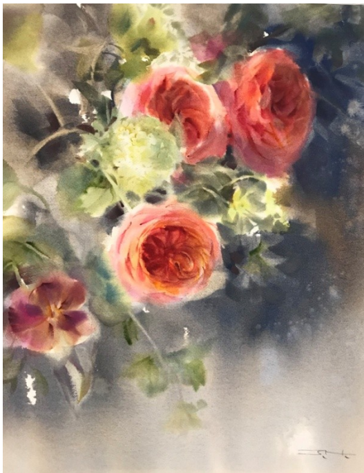
Tatsiana Harbacheuskaya Best of Show – Nocturne