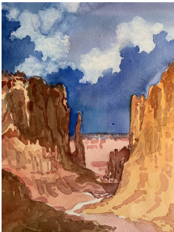
Barrie Cooke-Folsom 2 nd Place – Majestic Canyon