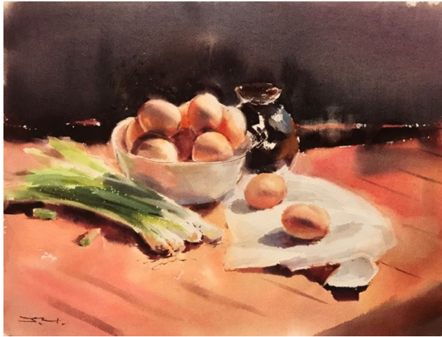
First Place – Sheila Spargo