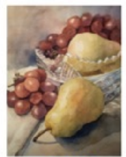
FIRST PLACE "Crystal Light" by Doni Murphy