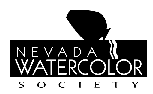
P. O. Box 27224 Las Vegas, NV 89126