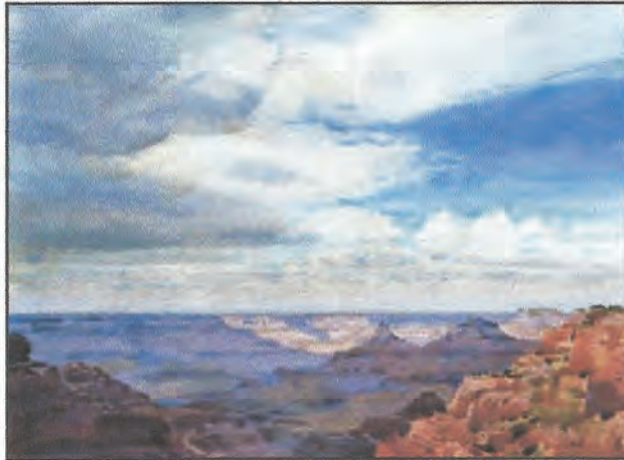
Canyons in the Sky, watercolor 22x30"