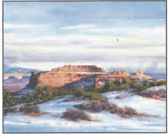
Edge of the Storm, watercolor 20x25"

This two day workshop in Las Vegas, Nevada will focus on building a strong foundation on which to confidently begin and finish your paintings. Participants will bring reference material and get advice about how to design their picture for a better chance of success.