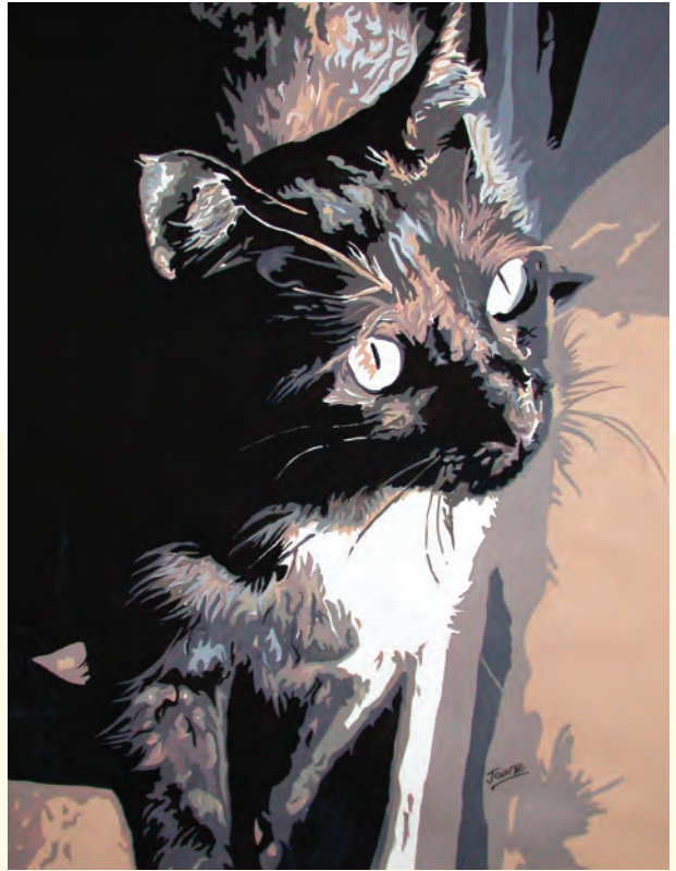
Shadow Stalker by Shirley Jeane Acrylic on 140-lb. (300gsm) cold-pressed Arches