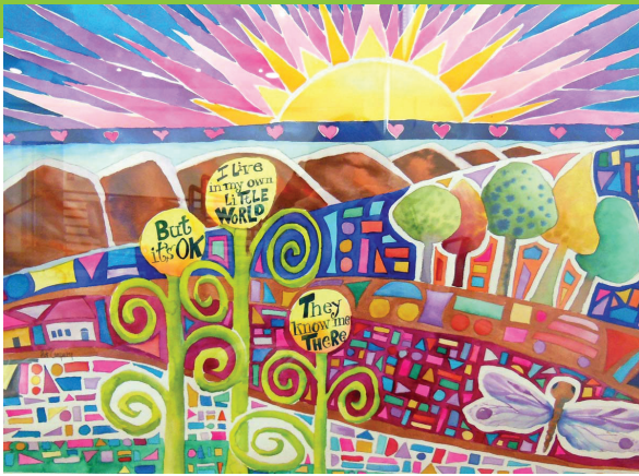
BEST OF SHOW "My World" by Pat Caspary