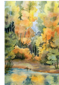
"Autumn" by Peggy Sudweeks