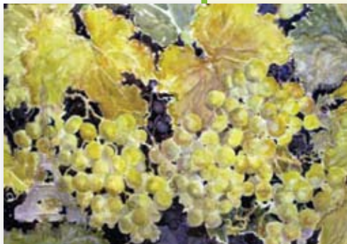
French Wine on the Vine