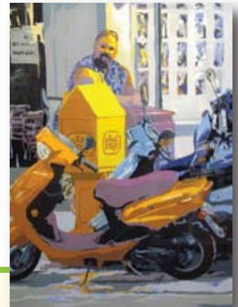
It Ain't No Harley