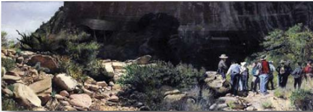
Ice Box Canyon