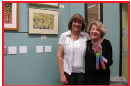
NVWS Spring Show at Green Valley Library