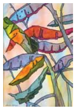
"Tropical Foliage" by Sheila Spargo