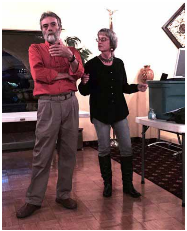
A very special THANK YOU to Spike Ress and Sue Cotter