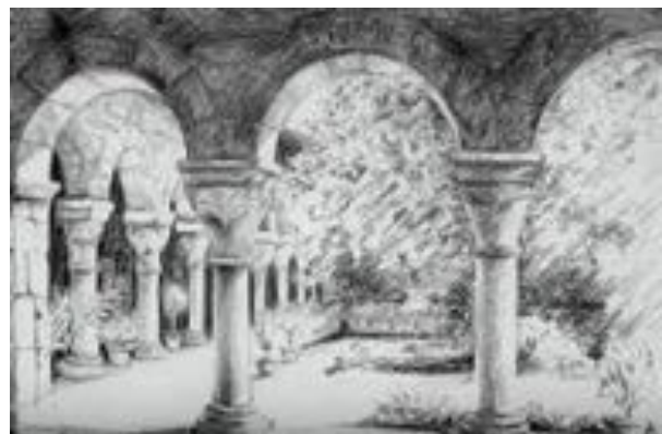
A Drawing from Roberto Rico -