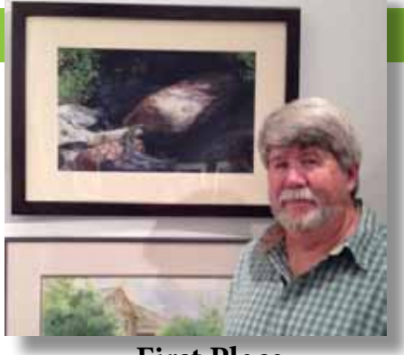
First Place One Fine Day in Lizard Canyon by David Mazur