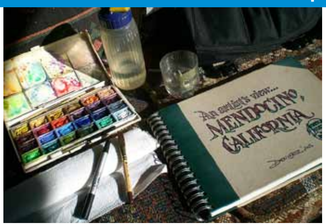
May 20-21-22 (Monday - Wednesday) Watercolor Journalism Workshop