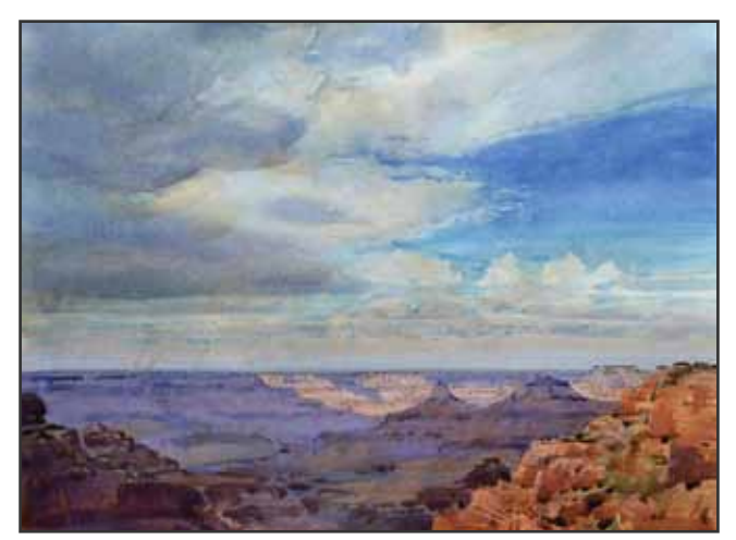
Canyons in the Sky, watercolor 22x30"