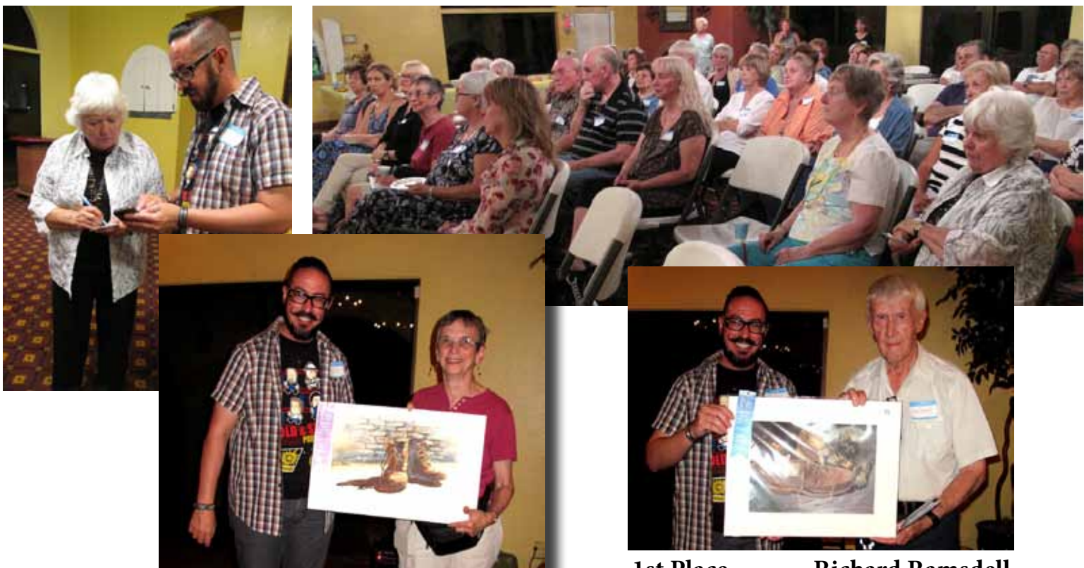
Best of Show