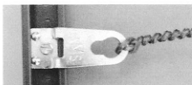
screw in hanger