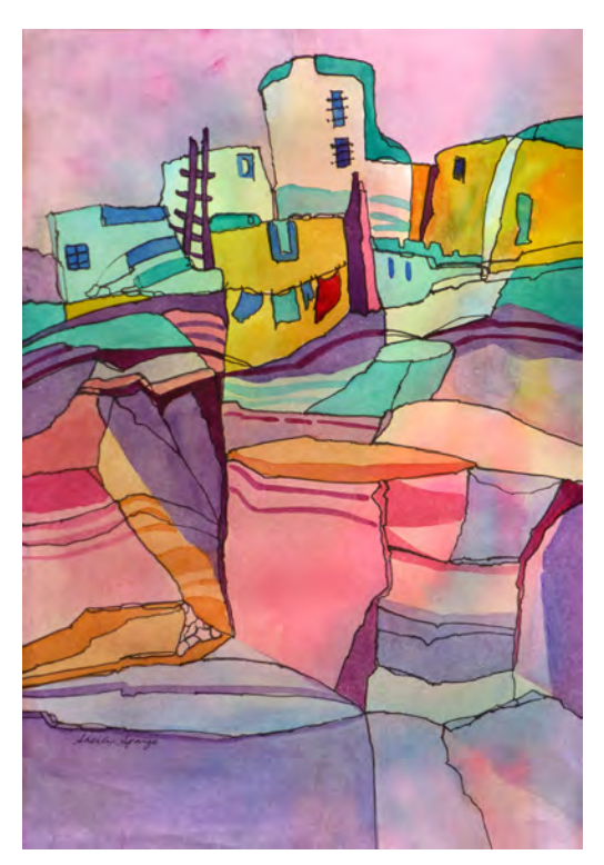
CREATIVE AWARD "Pueblo Forms" by Sheila Spargo