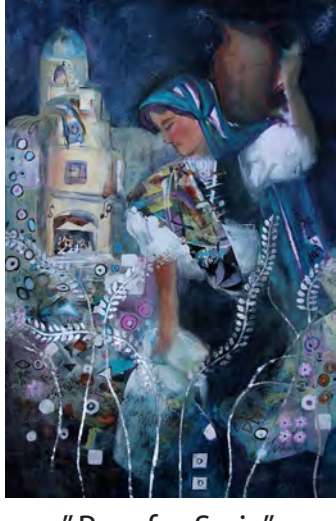
"Pray for Syria" by Elena Wherry