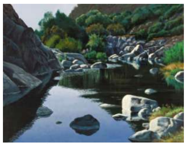
SECOND PLACE "The Quiet Time" by Clayton Rippey