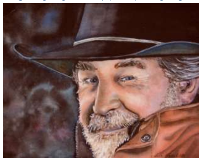
"Jim Cross" by Sue Roach