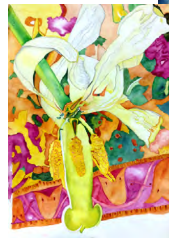
"Colors of Fall" by Patty Stroupe