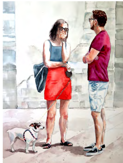
SECOND PLACE "Conversation" by Myra Oberman