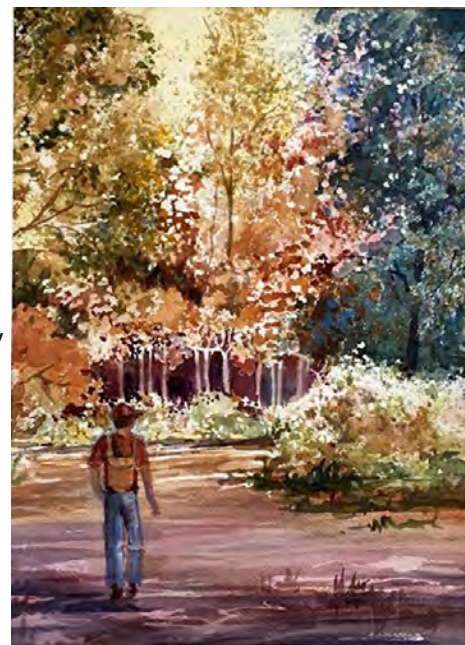
THIRD PLACE "Road Less Traveled" by Renee Clark