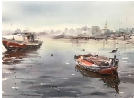
Cold Water by Tatsiana Harbacheuskaya SECOND PLACE