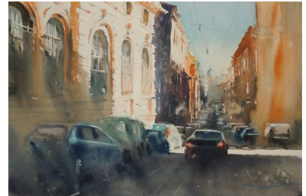
Light by Sergij Lysyy BEST OF SHOW

Sahara West Library 9600 West Sahara Ave • Las Vegas, NV